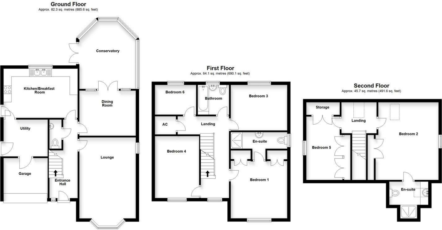
Total area: approx. 192.1 sq. metres (2067.3 sq. feet)

IMPORTANT: We would like to inform prospective purchasers that these sales particulars have been prepared as a general guide only. A detailed survey has not been carried out, nor the service, appliances and fittings tested. Room sizes should not be relied upon for furnishing purposes and are approximate. If floor plans and included, they are for guidance and illustration purposes only and may not be to scale. If there are important matters likely to affect your decision to buy, please contact us before viewing the property.